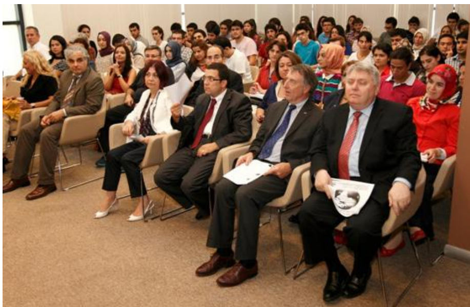
Audience at the 2nd Acibadem Family Medicine Symposium