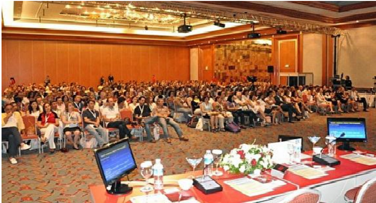
Audience at Family Medicine Fall School, Antalya, Turkey