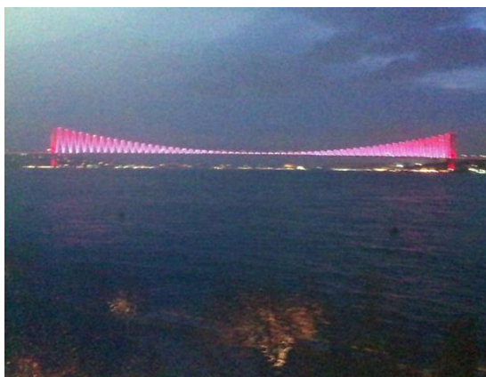
The Bosphorus Bridge at night, Istanbul, Turkey

Lying on my hotel bed, the view was stunning through the window that framed the Bosphorus Bridge. The soft lights of the low-rise buildings along both shores outlined the glassy black water that pulled my gaze to the bridge. My eyes refused to close, even though they were aching for sleep after 23 hours in transit followed by a late night dinner with my Turkish hosts. The dancing shapes of the violet-blue-white lights of the bridge were magical as they shimmered into the dark night sky and onto the black water. Months later, I continue to think back to that vista – it soothed me into deep slumber as I reflected on the wondrous place known as Istanbul.