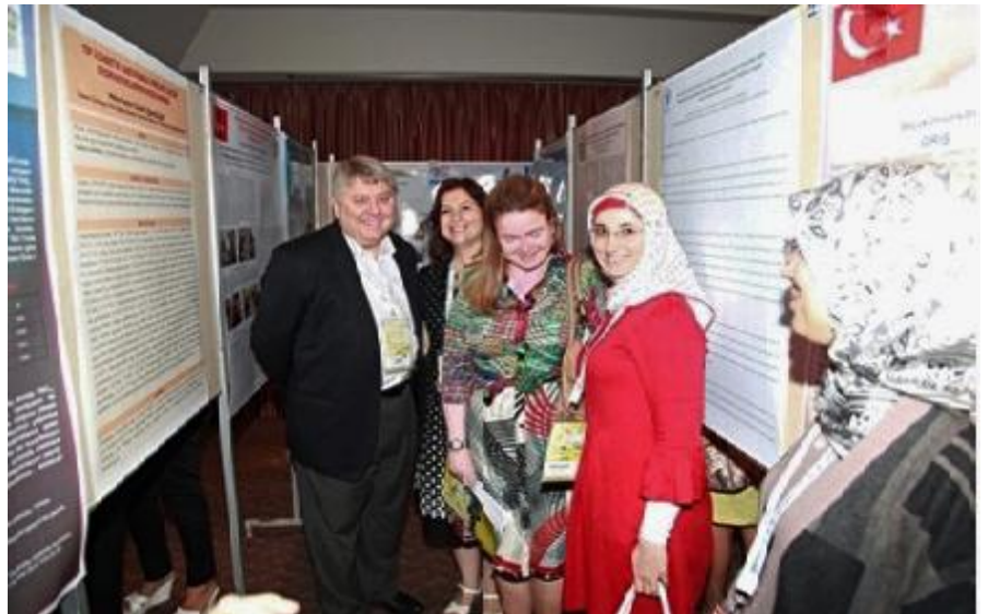
Poster walk at Family Medicine Fall School co-sponsored by TAHEV and TAHUD